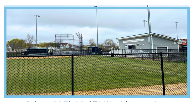
Griswold Field: 671 Washington Ave