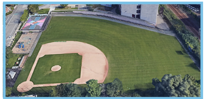
Garfield Baseball Field: 186 Garfield Ave