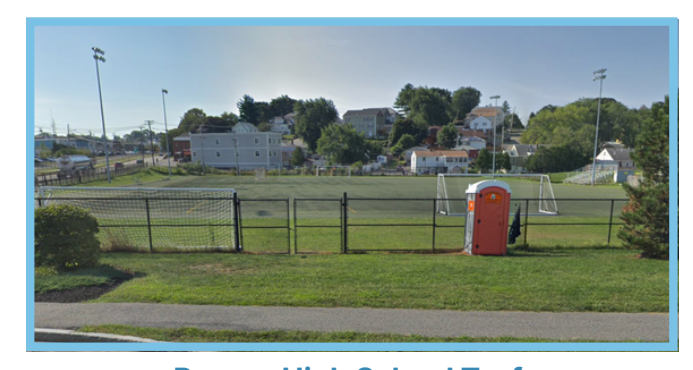
Revere High School Turf: 140 American Legion Hwy