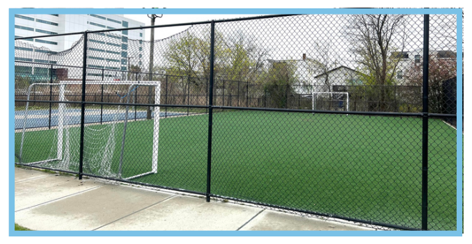
Oak Island Turf: Dashwood Street