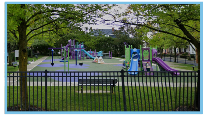
Sonny Myers Park: 120 Beach Street