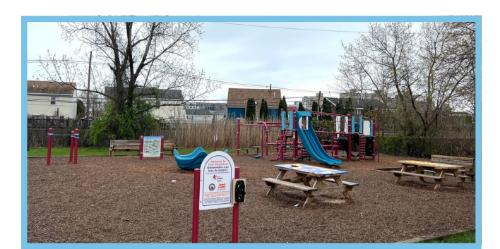
Lighthouse Tot Lot: 395 Revere Street