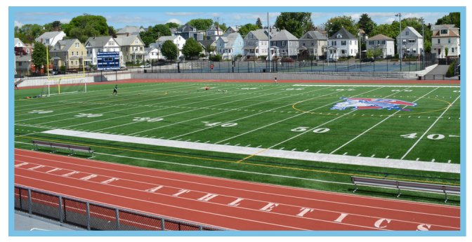
Harry Della Russo Stadium: Park Ave