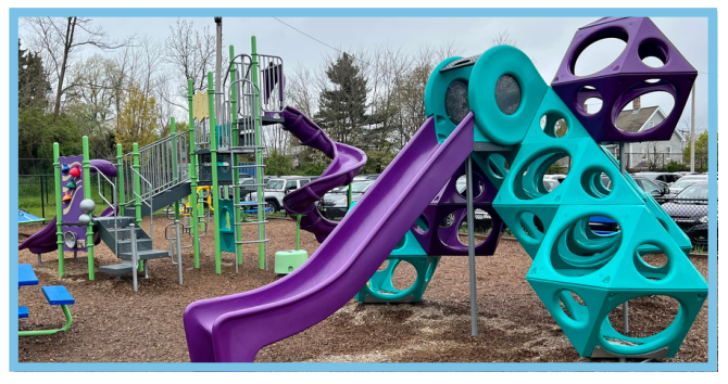
Lincoln School Playground: 68 Tuckerman Street