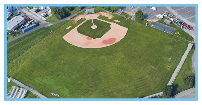
Revere High School Baseball Field: 101 School Street